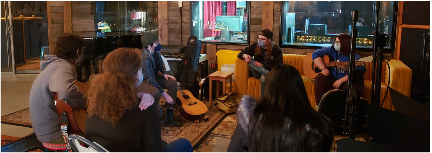
Photo: Group Mentorship - Intro to the Music Biz